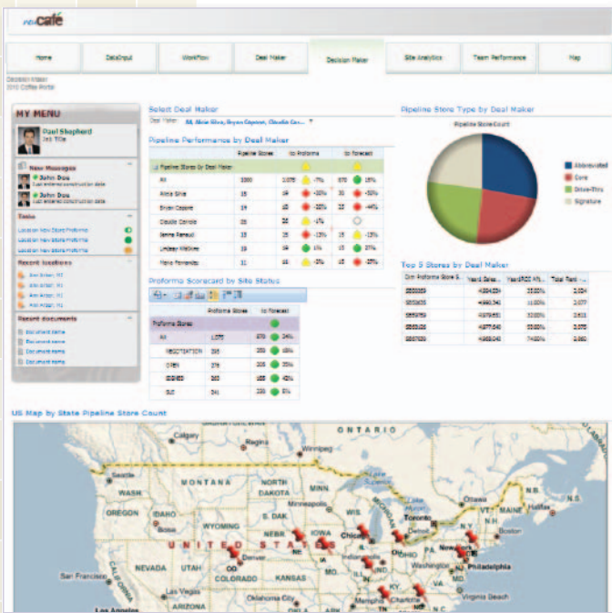
Microsoft PerformancePoint Services dashboard

CountERP for Oracle EBS uses NoetixViews® to deliver the fastest connection possible between decision makers and operational data, streamlining the manually-intensive process of implementing reporting tools and enterprise-wide BI initiatives. Neudesic leverages the power of Microsoft BI within SharePoint to deliver business critical information from the Financial, Supply Chain, Manufacturing and/or Human Resources modules in Oracle EBS.