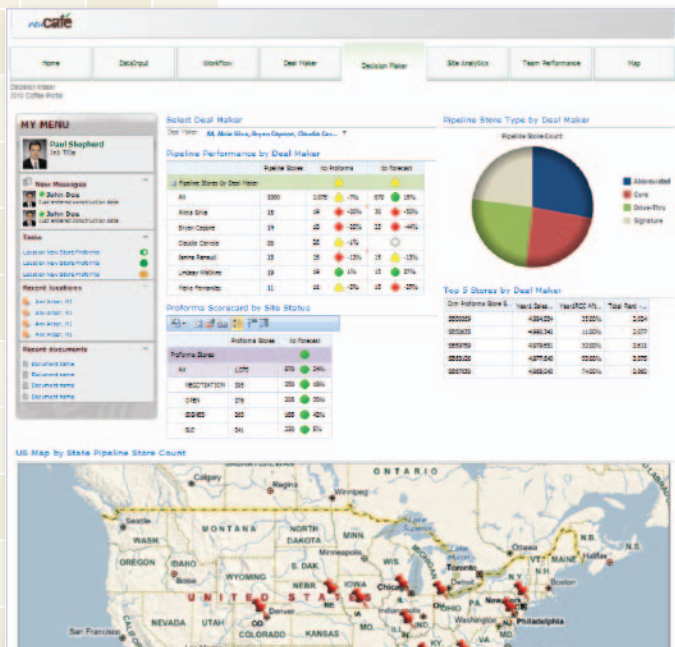
Microsoft PerformancePoint Services dashboard

Whether your business analysts are demanding SAP connectivity to enable self-service analytics or looking for alternatives to SAP BW, Neudesic can help. CountERPart for SAP uses SAP-certified connector technology to deliver the fastest link between decision makers and operational data, streamlining the manually-intensive process of implementing reporting tools and enterprise-wide BI initiatives. Neudesic leverages the power of Microsoft BI within SharePoint to deliver business critical information from the financial, control, sales and distribution, and materials management of SAP.